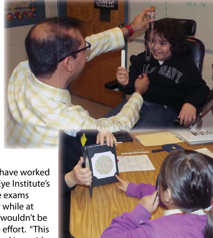
Two children during exams at Marshall Street Elementary School.

For more information on the "Looking Out for Kids" initiative, email lookingoutforkids@salus.edu or visit www.TElvision.com/LOFK